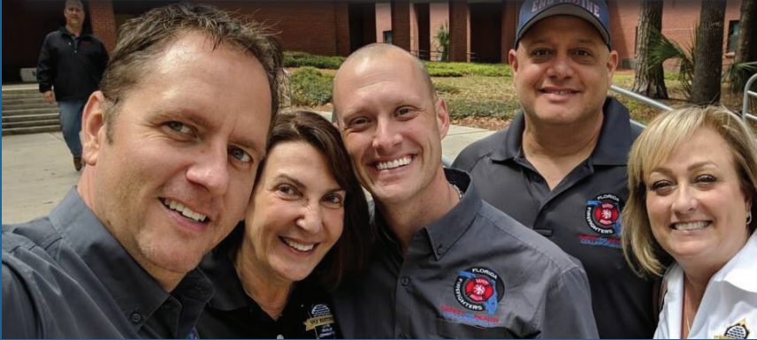
The UCF RESTORES and Florida Firefighters Safety and Health Collaborative partnership team.

teams are put in place. But what resources are available to those in need after the debriefing is over and the team leaves?