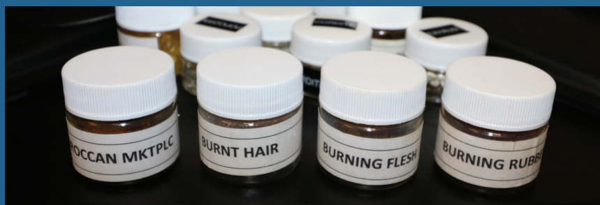
UCF RESTORES incorporates the sensory element of smell as part of the virtual reality exposure therapy.

experience, the FFSHC provides those in need with the necessary support to seek help for anxiety and other distressing symptoms that often accompany repeated exposure to traumatic events.